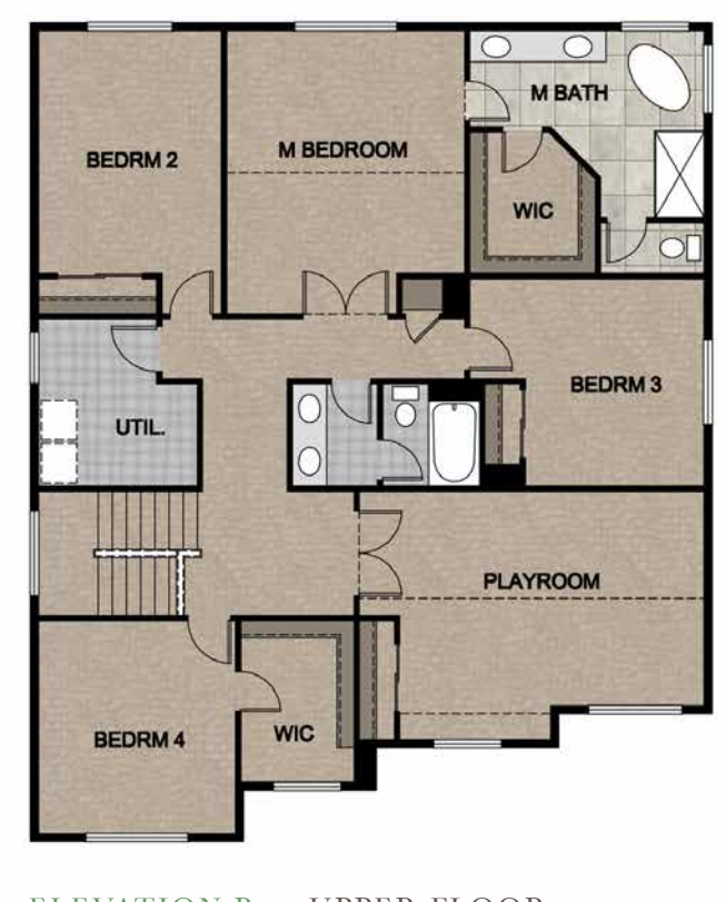
ELEVATION B — UPPER FLOOR (Elevation B has playroom extension in front)