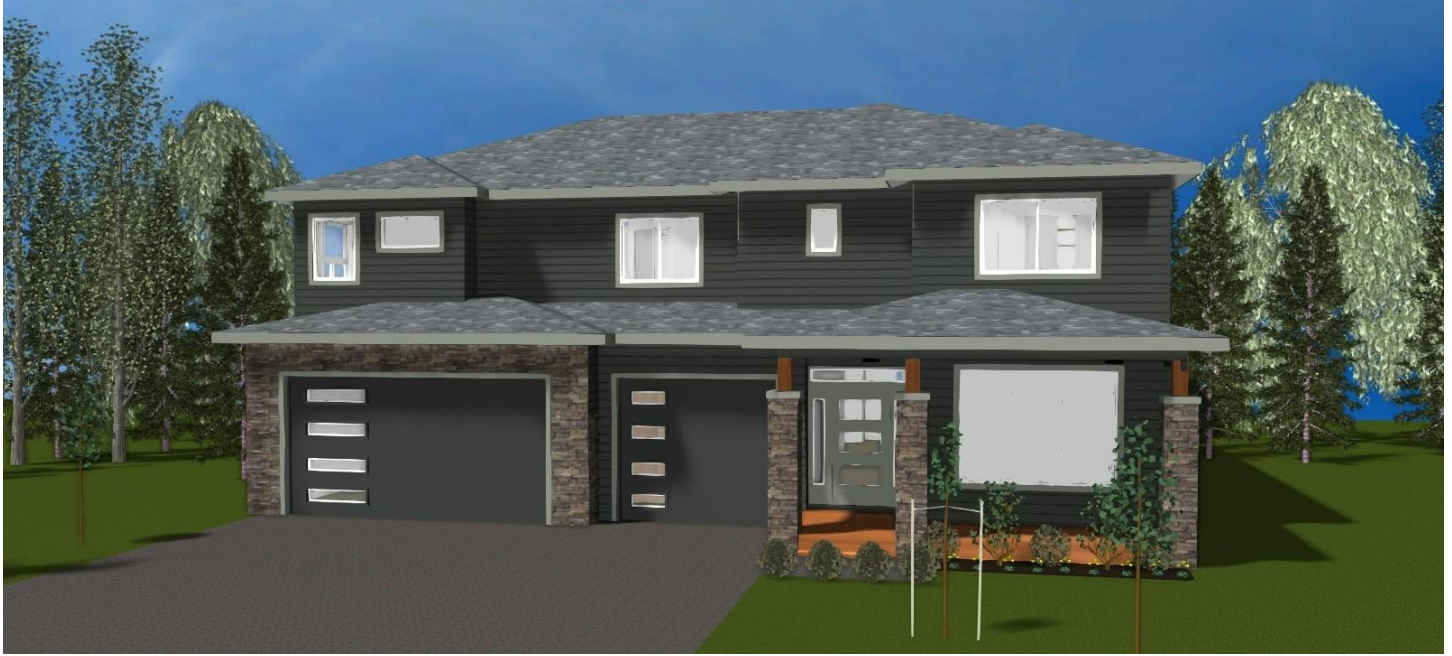
ARTISTIC RENDERING REFER TO FEATURES LIST FOR DETAILS